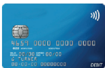
contact interface card