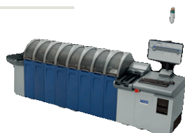
Datacard MX System (with Toaster rack)